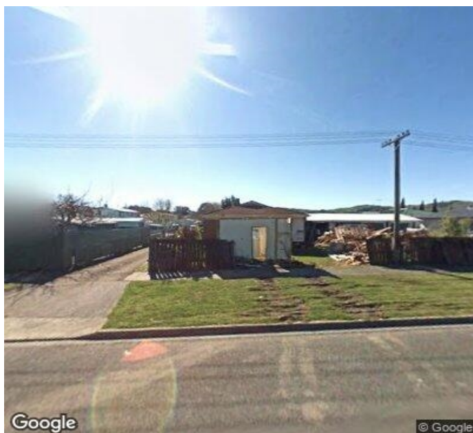
Google Google Streetview Image

Information on this plan is indicative only and not mapped to a survey accurate scale. Gisborne District Council accepts no liability for its accuracy and it is your responsibility to ensure that the data contained herein is appropriate and applicable to the end use intended. The information included in this report is indicative only and does not purport to be a complete database of all information in Gisborne District Council's possession or control. Gisborne District Council shall not be liable for any loss, damage, cost or expense (whether direct or indirect) arising from reliance upon or use of any information provided, or Council's failure to provide this report. Copyright under Creative Commons Attribution 4.0 International licence. May contain data sourced from the LINZ Data Service, BOPLASS or Gisborne District Council. For more detailed information relating to this property please request a Land Information Memorandum report from Gisborne District Council - http://www.gdc.govt.nz/land-information-memorandum-lim/